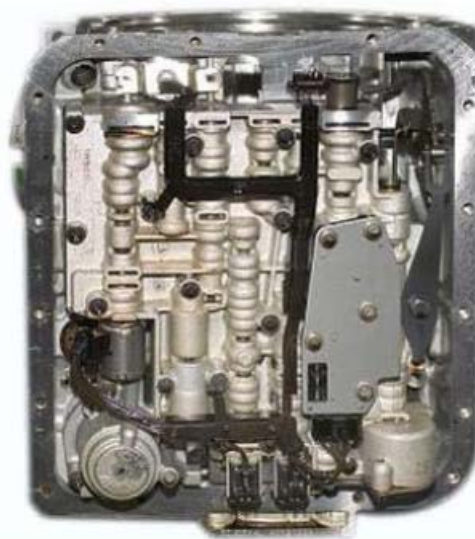
With MOTUL TRANSMISSION CLEAN

Combined with other products from the MOTUL range such as DIESEL SYSTEM CLEAN, FUEL SYSTEM CLEAN and ENGINE CLEAN, TRANSMISSION CLEAN actively increase the driving comfort an life duration of your vehicle.