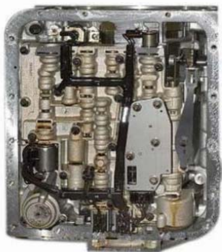
Without MOTUL TRANSMISSION CLEAN

This improved cleanliness of parts and components of the transmission is proven visible with evident and direct results: